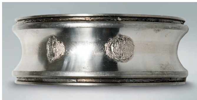
Typical signs of fatigue: small, flat flakes of the bearing material become detached (flaking/spalling).

In addition to natural wear and tear, bearings can fail (prematurely) due to other factors such as extreme temperatures, cracks, lack of lubrication, or damage to the seals or cage. Bearing damage of this kind is often the result of choosing the wrong bearings, inaccuracies in the design of the surrounding components, incorrect installation or insufficient maintenance.